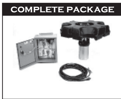
U.S. Package: Unit, NEMA 3R Power Panel (with timer, GFCI (except 460V), breaker, surge arrester, HOA switch and thermal overload protection), 50 ft. of SOOW cable. Int'l Package: Unit and 15m of cable (no cable on CE).